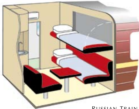
RUSSIAN TRAIN, 'GOLDEN EAGLE EXPRESS'