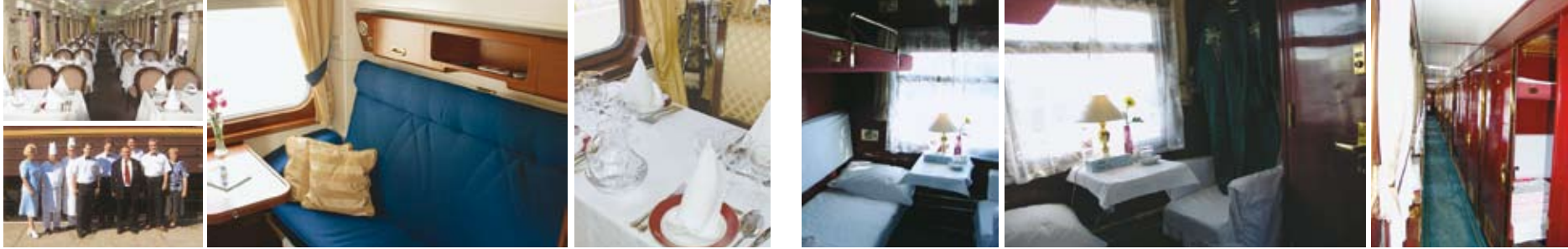
DINING CAR, STAFF, REGISTAN CLASS CABIN & DINING SETTING ABOARD THE 'GOLDEN EAGLE EXPRESS'