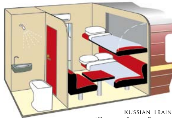
RUSSIAN TRAIN, 'GOLDEN EAGLE EXPRESS'